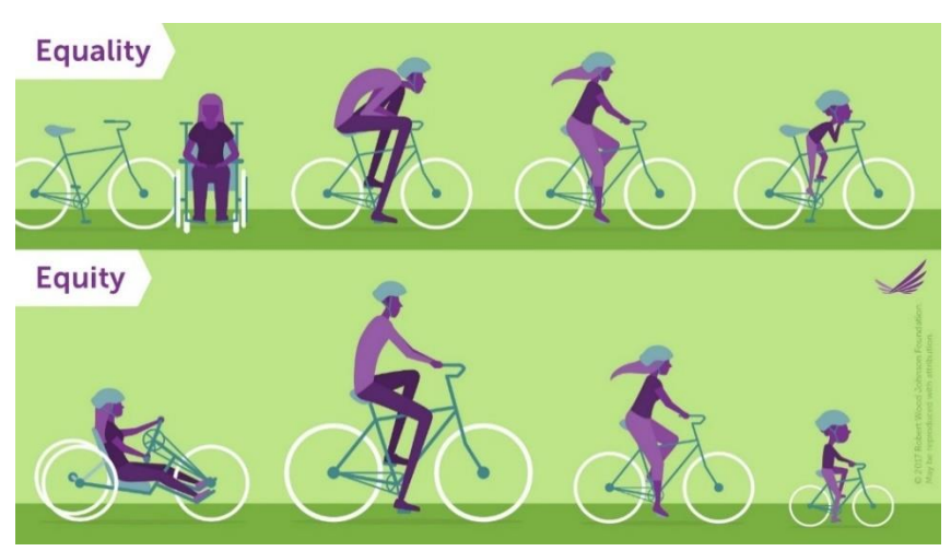
FIGURE 2. EQUALITY VS. EQUITY (ROBERT WOOD JOHNSON FOUNDATION, 2022)

unique needs and circumstances, and provides them with what they need to achieve the same outcome as others.